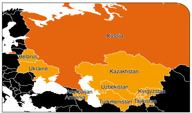
Russia's Strategic Relationship with Near-Abroad Countries

The Kremlin will likely seek to strengthen its position in the South Caucasus and Central Asia, while continuing to test Western resolve over Ukraine and energy trade.